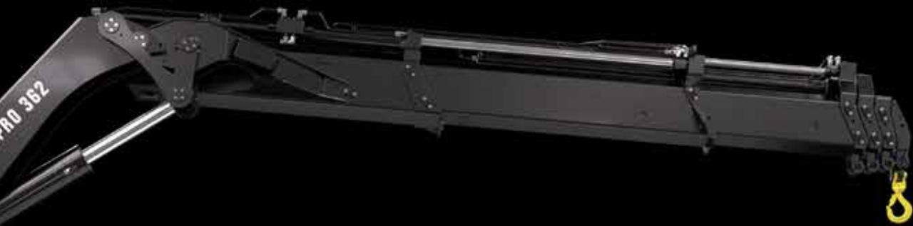
Automatic Speed Control (ASC)